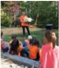
The students really enjoyed the visit to the Parkwood Pumpkin Patch!

We are so grateful to all of our WEE Center families. Your involvement in your child's education and school help set the foundation for a lifetime of learning and spirituality. It is a joy and a pleasure to have an opportunity to be a part of your lives. The WEE Center is committed to carrying out God's work here at Parkwood Baptist Church. We do this by loving your children, and your families, while we all learn about God's love. Thank you for giving us this opportunity.